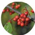
Cotoneaster glaucophyllus (bright bead cotoneaster)