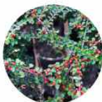
Cotoneaster horizontalis (wall spray)