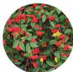
Cotoneaster simonsii (khasia berry)

Cotoneaster is an introduced bushy plant with brightly-coloured berries that has been classified as a pest. There are three different types in the Ohau and Waitaki Lakes region: