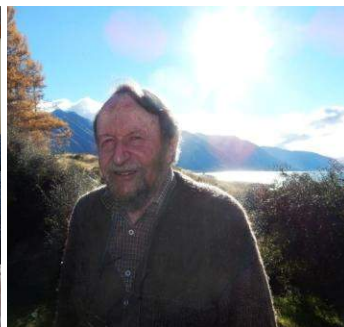
Malcolm McMillan Lake Ohau Village