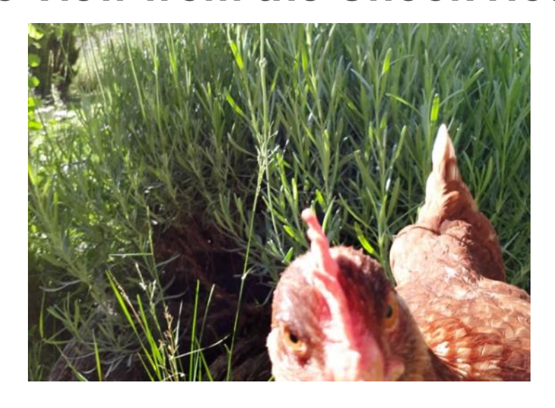
Halloween 2020, Trick or treat? or does something more fowl loom?