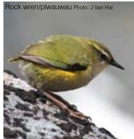
Rock wren/piwauwau