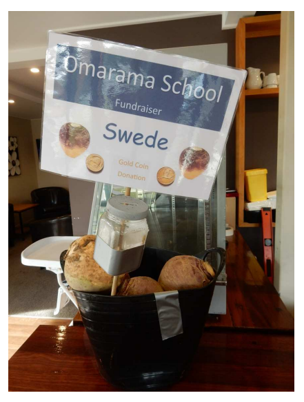
It may not be your favourite but these swedes were the most liked vegetable on our Facebook page which translated into a successful fundraiser - one of several run by Friends of Omarama School this year.