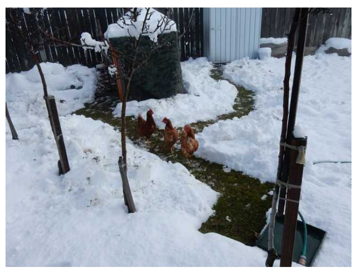
Snow-raking at the chook house (June 2015)