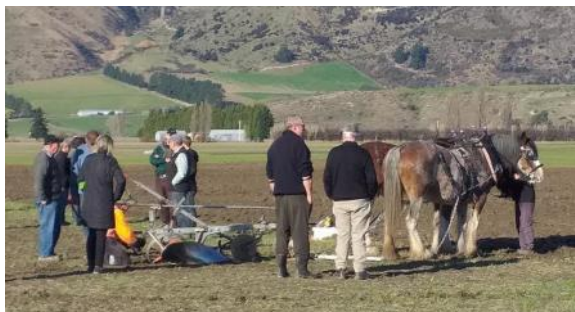
Ploughing contestants and officials enjoy lunch at The Paddock in Lake Hawea run as a fundraiser for Omarama School.