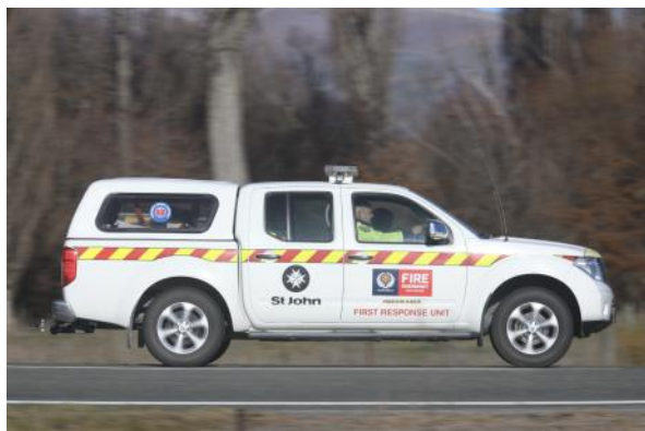
The Omarama Volunteer Fire Brigade's First Response heads to the Lindis Pass to attend a motor vehicle accident on Monday.