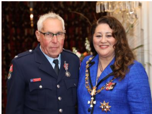
Maurice and Governor General Dame Cindy Kiro stand for the official photo.